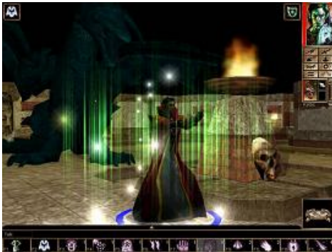
Figure 2: Casting a spell in The Catacombs

This three-dimensional game was developed using the BioWare Aurora toolset that was used to build NeverWinter Nights , a popular fantasy role-playing game based on Dungeons and Dragons . In this game, the storyline is that the player, an apprentice wizard, is asked by a mother to find her two young children who never returned from the catacombs. This is a linear game, where at each point there is only one possible task that the player may perform. We created three tasks, each progressively more complicated. The first involved unlocking the door to the catacombs involving two if statements; the second, building a bridge brick by brick with nested for loops; and the third, to solve a cryptogram using more nested for loops. In the 2 nd and 3 rd quests, incorrect answers result in decreasing player health. Each script developed for the quests is stored in the player's journal, which he or she can view while building the code, and refer to later in completing more difficult tasks in the game.